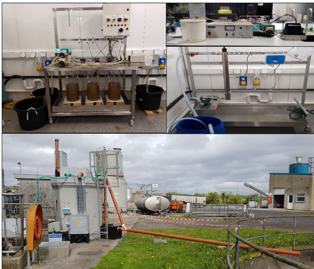
Fig. 2. Experimental systems used as part of the DairyWater project. Clockwise (from top left): laboratory-scale intermittently aerated sequencing batch reactor (IASBR) system; laboratory-scale pulsed ultra violet (PUV) system; low pressure ultra violet (LPUV) system; pilot-scale IASBR system.

et al. 2014). In silico metabolic profiling of the bacterial community was also performed to predict the abundance of functional gene families and to identify potential, key contributors to nutrient bioremediation (Ahmed et al. 2017). In an effort to corroborate the modelled outputs with respect to NGS determined dominant groups and metabolic functionalities, spatial distribution analyses was also performed. Fluorescence in situ Hybridisation (FISH) and quantitative polymerase chain reaction (qPCR) will be used for the enumeration of specific targeted microbial groups of interest and their spatial organisation within the representative biomass samples (Nielsen et al. 2009; van Loosdrecht et al. 2016). This study seeks to address the knowledge gap which exists in relation to the microbial community structures underpinning IASBR application. Such knowledge is critical to the optimisation of the IASBR technology, where a reliance on key microbiota can be demonstrated. While the target application of this project is the dairy processing sector, the findings have potential significance in the treatment of other agri-industrial wastewaters.